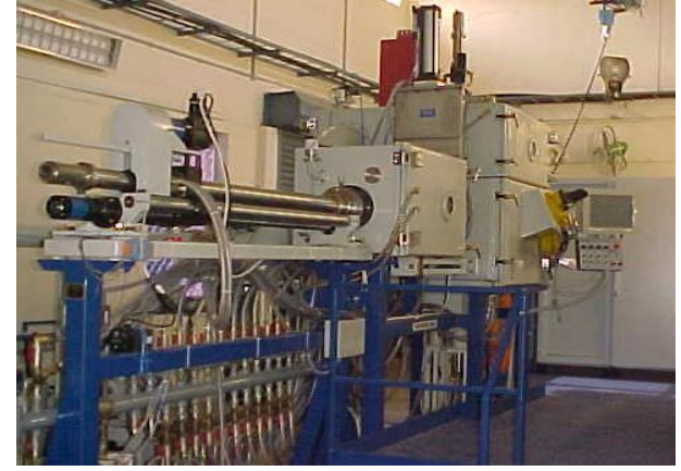
Electron beam physical vapour deposition (EBPVD) System

Application development in aero engine and power sector turbine blade and sponsored project on development of TBC coating rotor HP rotor turbine blades for helicopter engine is currently in progress at ARCI.